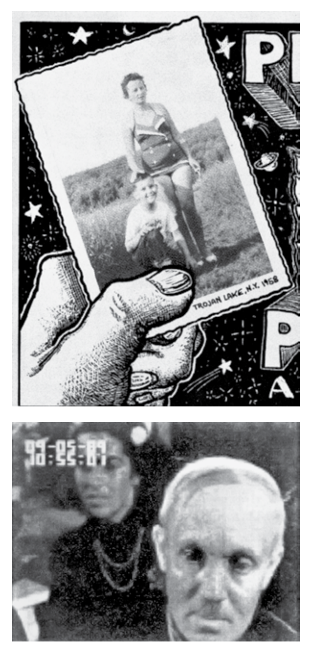
Figure 2 These two images, from Spiegelman's Maus (1987: 100) (above) and Sebald's Austerlitz (2001: 251), illustrate the performative regime of the photograph and the gazes of familial and affiliative postmemory.